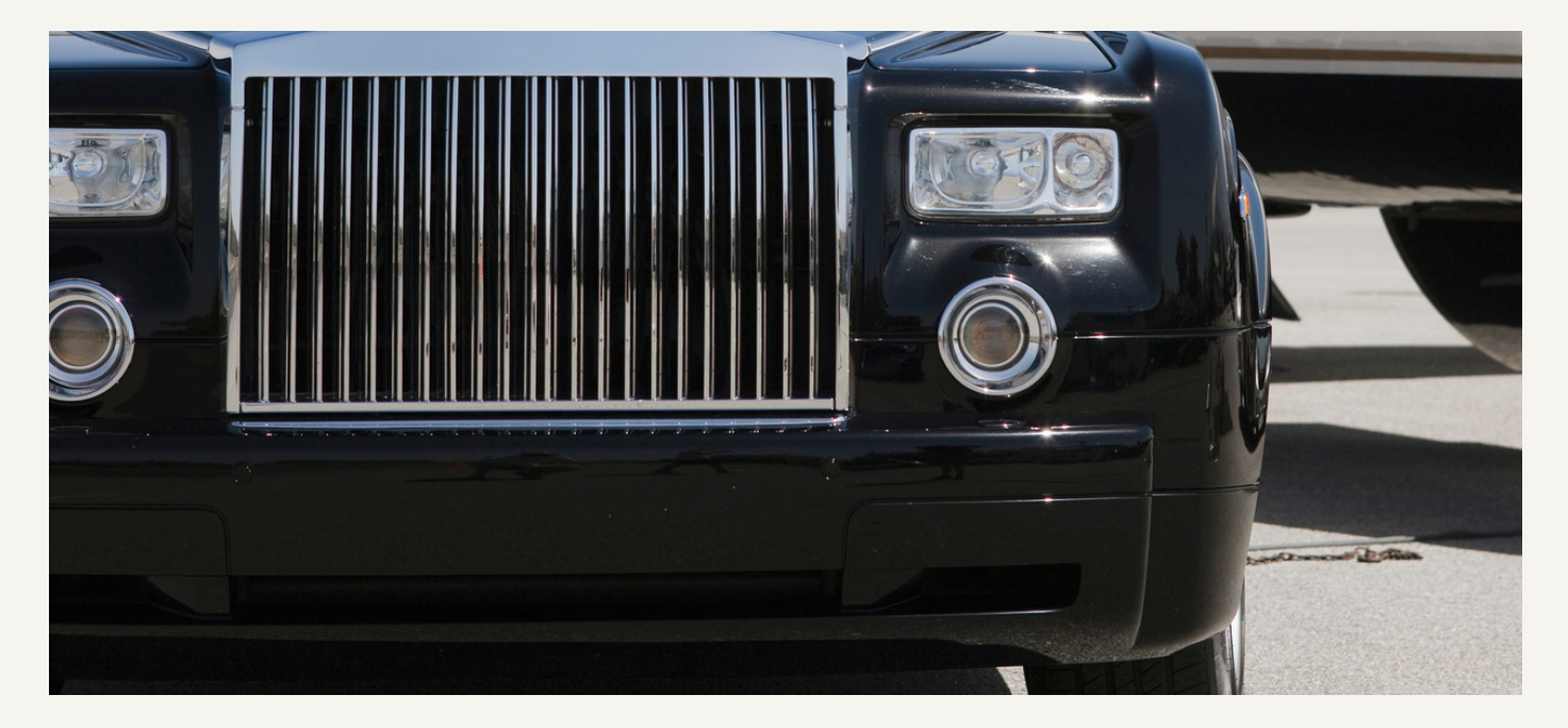
PERSONALIZING PLASTIC SURGERY WITH VIP GLOBAL CARE

MERGING EXPERTISE AND INNOVATION FOR SURGICAL EXCELLENCE